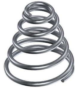
CONICAL COMPR. SPRING